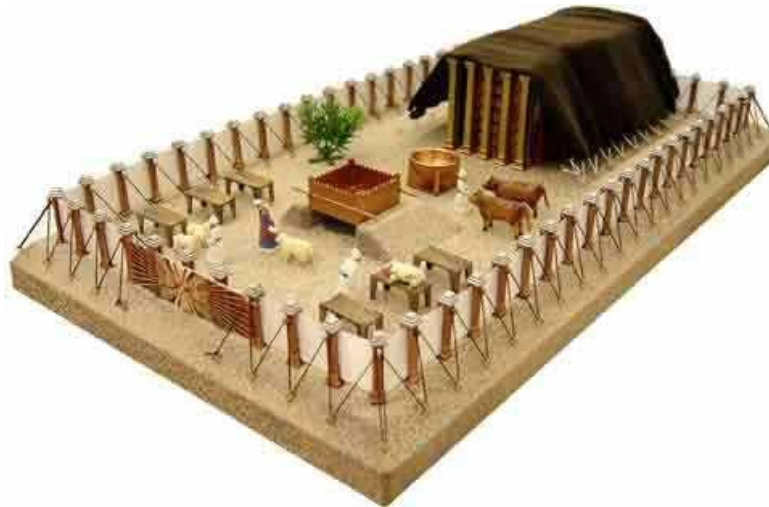
The Tabernacle of ancient Israel

the ashes to place them outside the camp. Upon returning to the camp, the linen garments would be again adorned and now the morning sacrifice was offered.